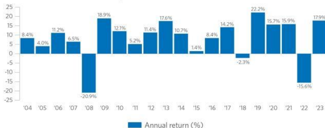
Calendar-Year Returns for the 60/40 Portfolio

The 60/40 Portfolio is comprised of 60% S&P 500 Index, 40% Bloomberg US Aggregate Bond Index. Past performance does not guarantee future performance. It is not possible to directly invest in an index.